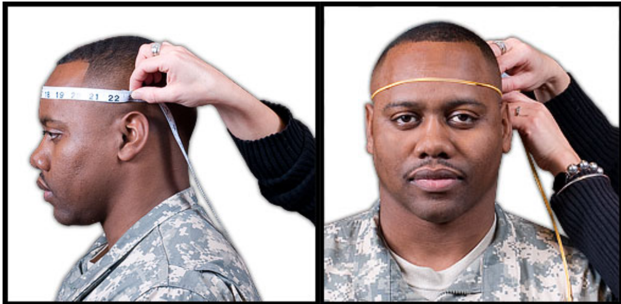
HAT SIZE CHART

Alternately, you may use a piece of string or cord and then measure the length of the cord.